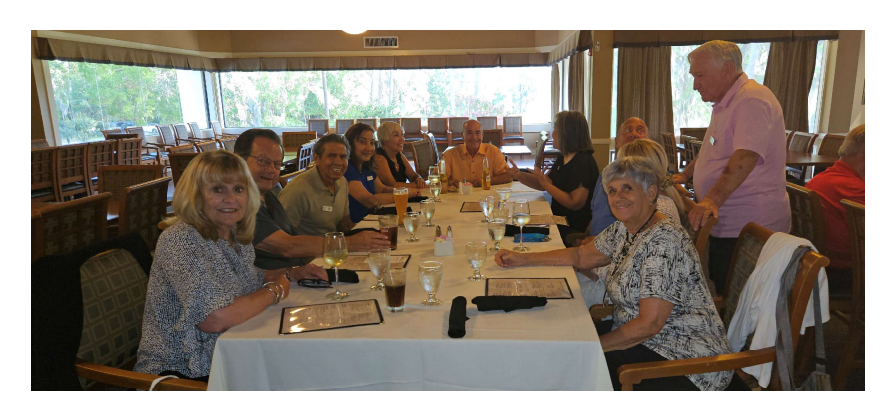
April 25 Pine Lakes Dinner

Recently, we sold our HVAC business in Pennsylvania and are currently enjoying a period of temporary retirement. Our passion lies in exploring new regions and engaging with diverse individuals, and we look forward to establishing new connections here in Palm Coast.