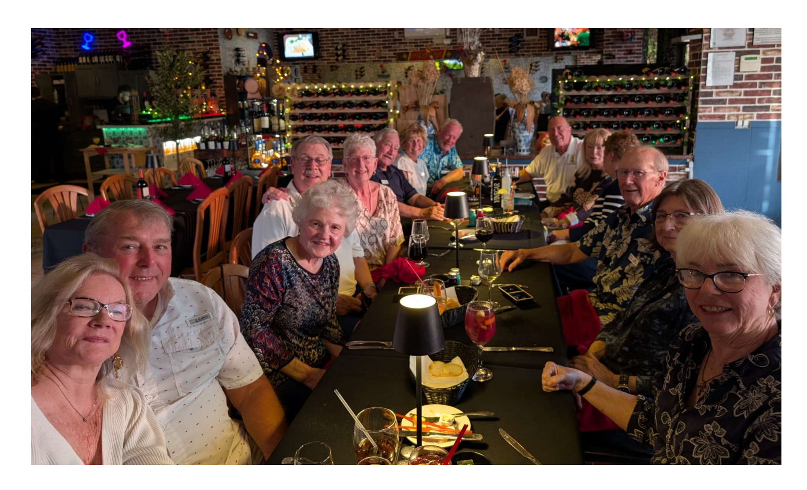
Thirsty Thursday at the Portuguese Wine Bar