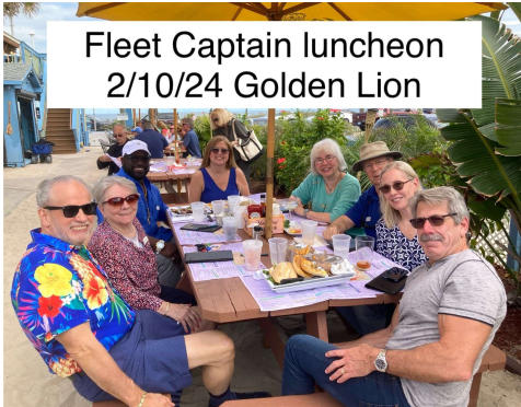
Fleet Captain luncheon 2/10/24 Golden Lion

02/03 - CPR / AED training and certification 02/03. Flagler County Fire did an outstanding job, and those who participated earned a BLS Certification.