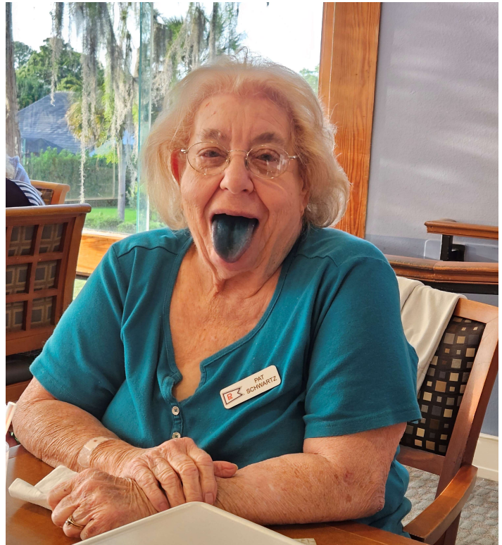
Too much purple frosting!