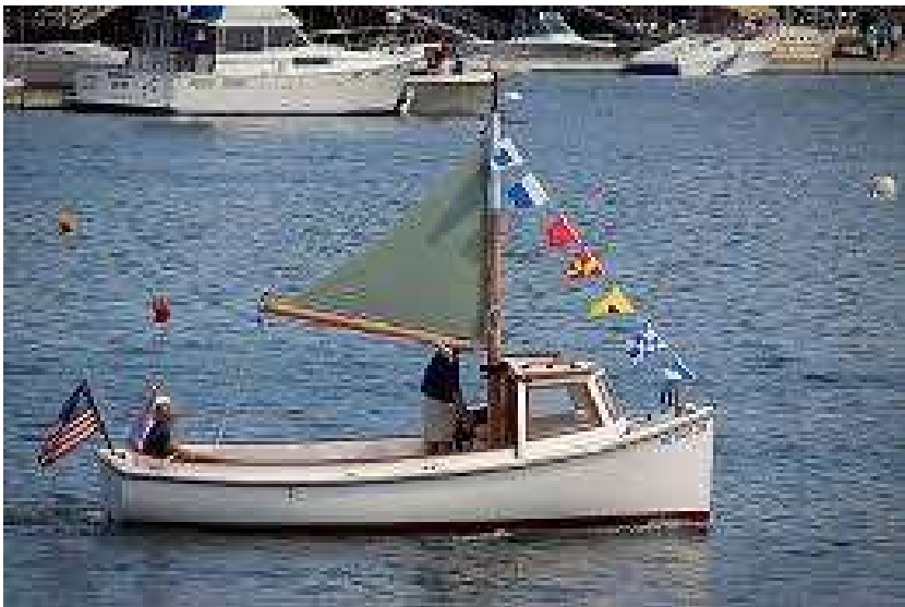
(Similar Herreshoff Harbor Pilot)